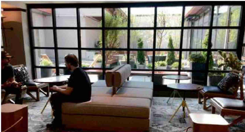
Floor-to-ceiling windows and skylights lighten up Freepoint’s new expanded lobby.

Linda Laban can be reached at soundz@me.com