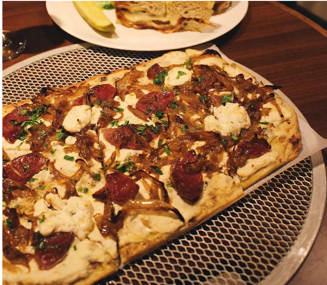
Then, their delicious burger and their bacon and apple grilled cheese. It was perfect.