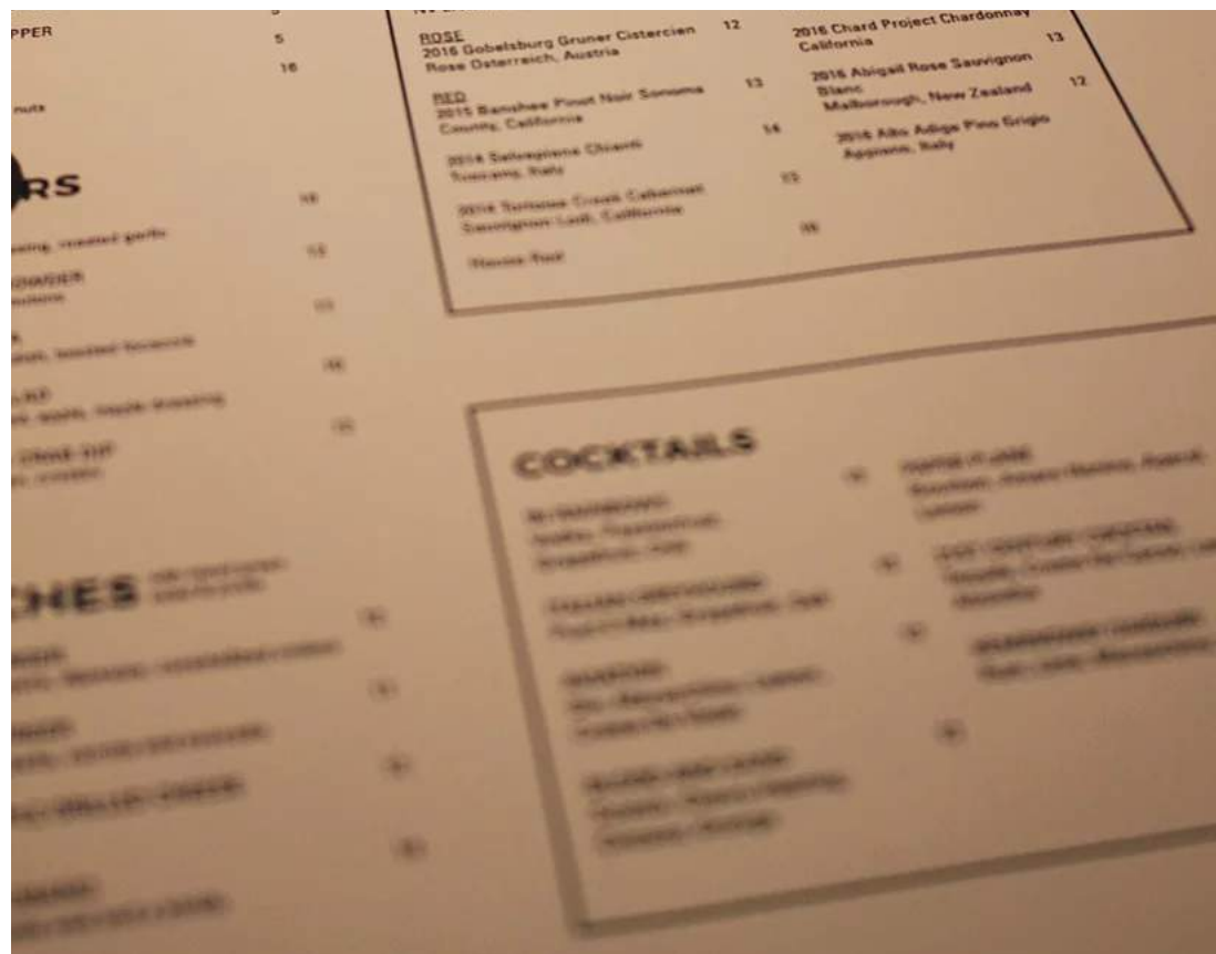
My friend and I started with some champagne and a few of their appetizers — their beautiful platter of artisan cheeses and cured meats, roasted nuts, and a super delicious artichoke and crab dip made with spinach and parmesan.